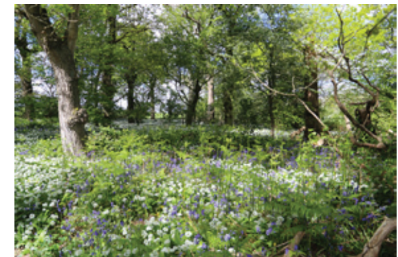
Fordington Wood, Well Vale