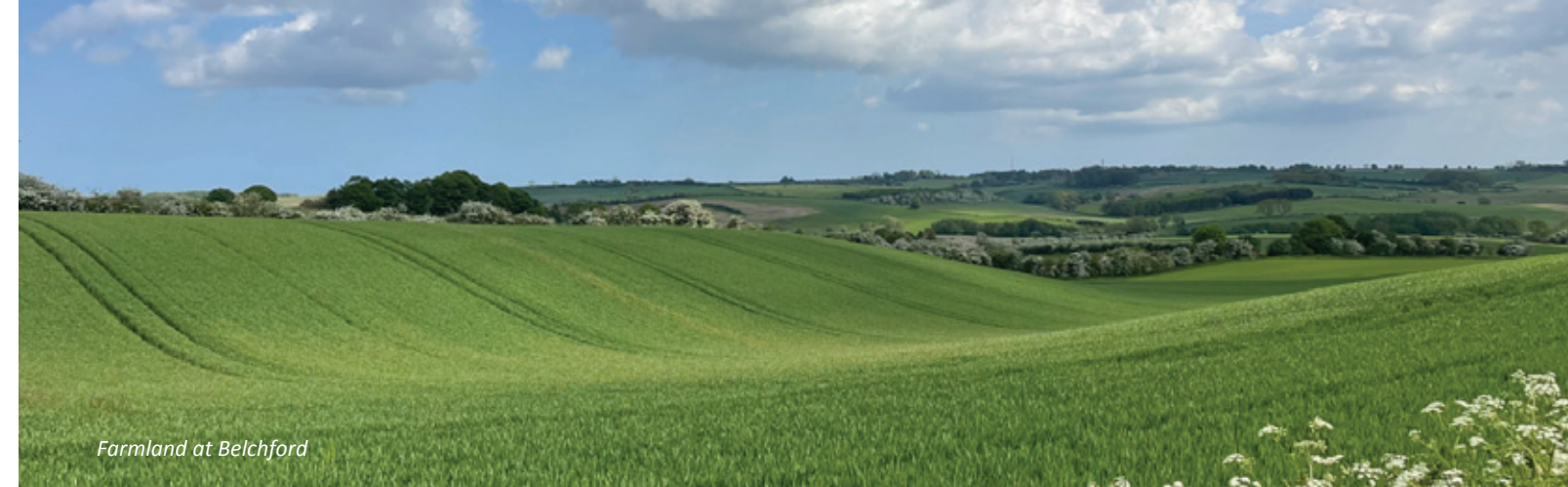
Farmland at Belchford