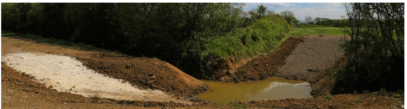
Newly created water splash (LWCS)