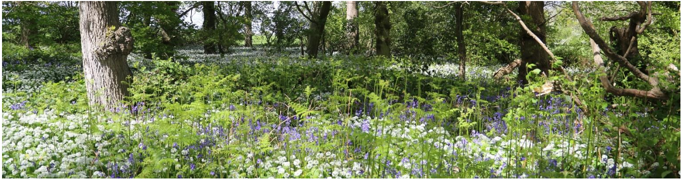
Bluebells and wild garlic in Fordington Wood (LWCS)