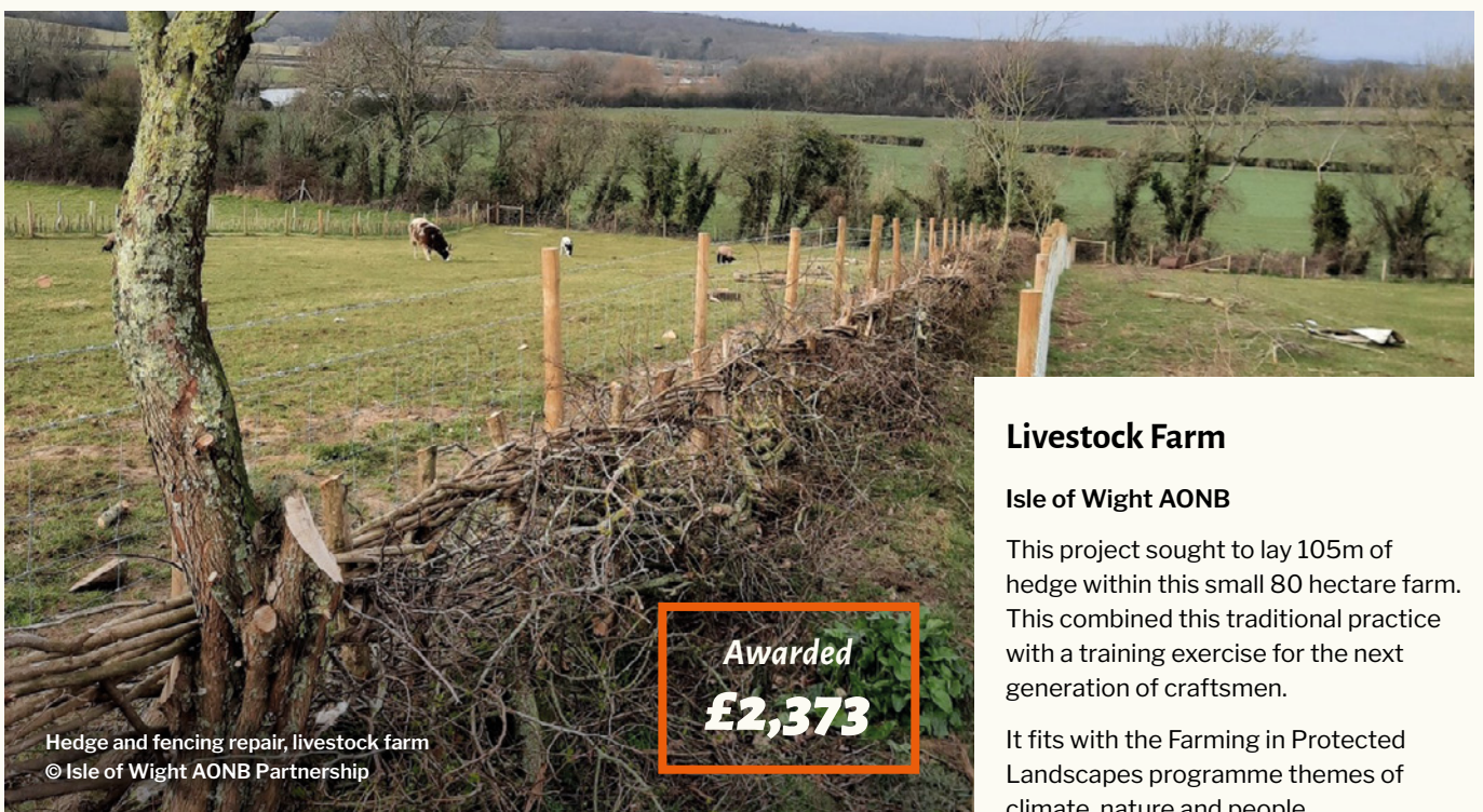
Hedge and fencing repair, livestock farm