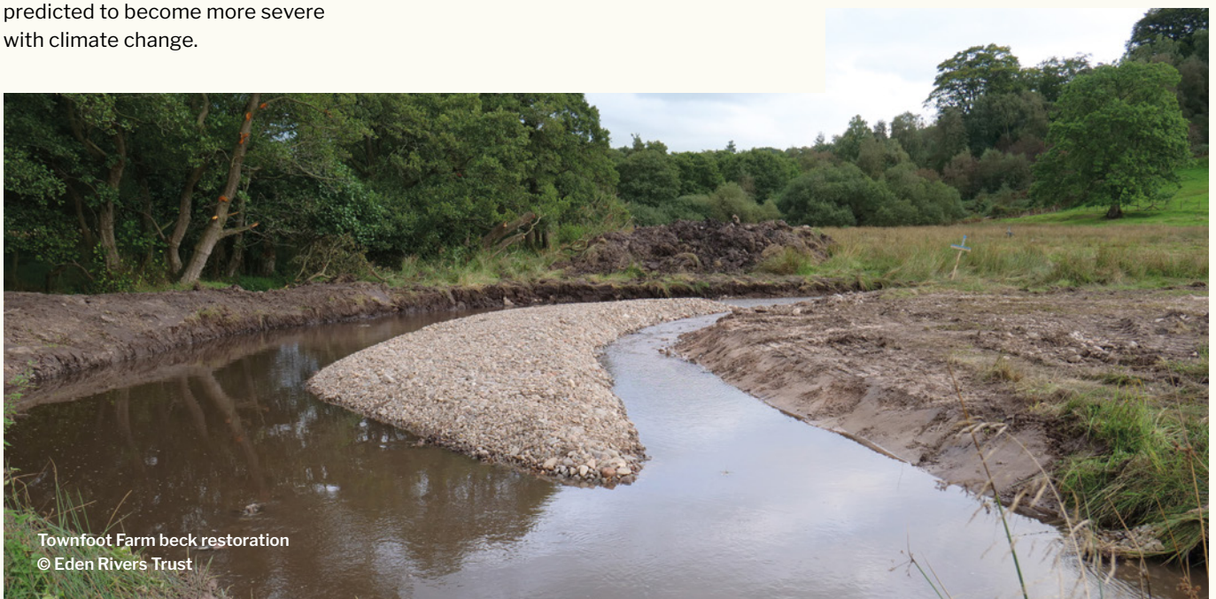
Townfoot Farm beck restoration

PLACE Re-establishing a key landscape feature.