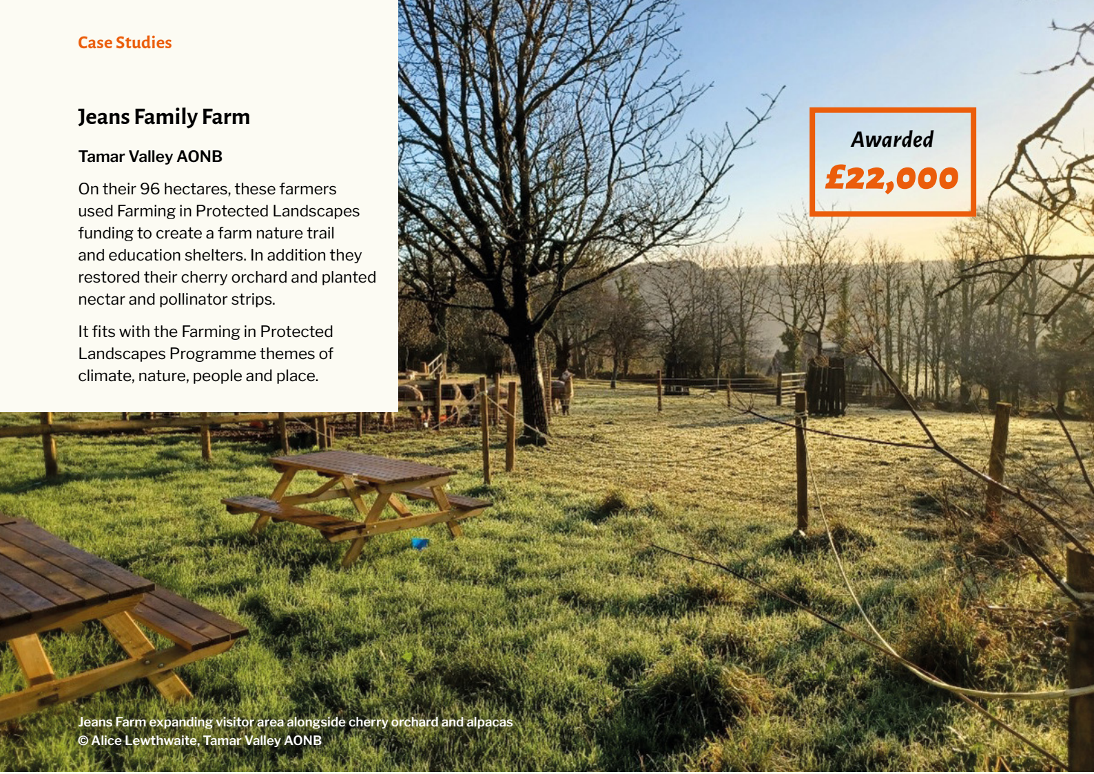
Jeans Farm expanding visitor area alongside cherry orchard and alpacas