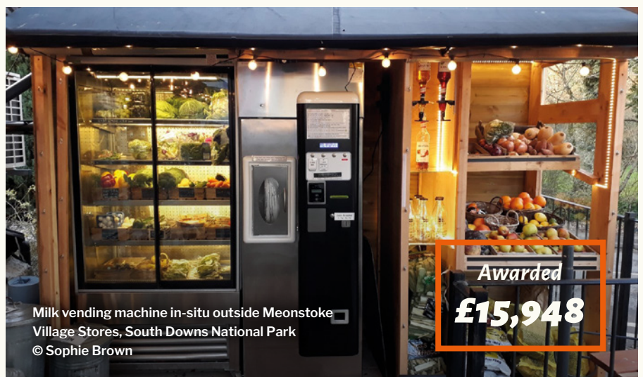
Milk vending machine in-situ outside Meonstoke Village Stores, South Downs National Park

It fits with the programme themes of climate, nature, place and people.