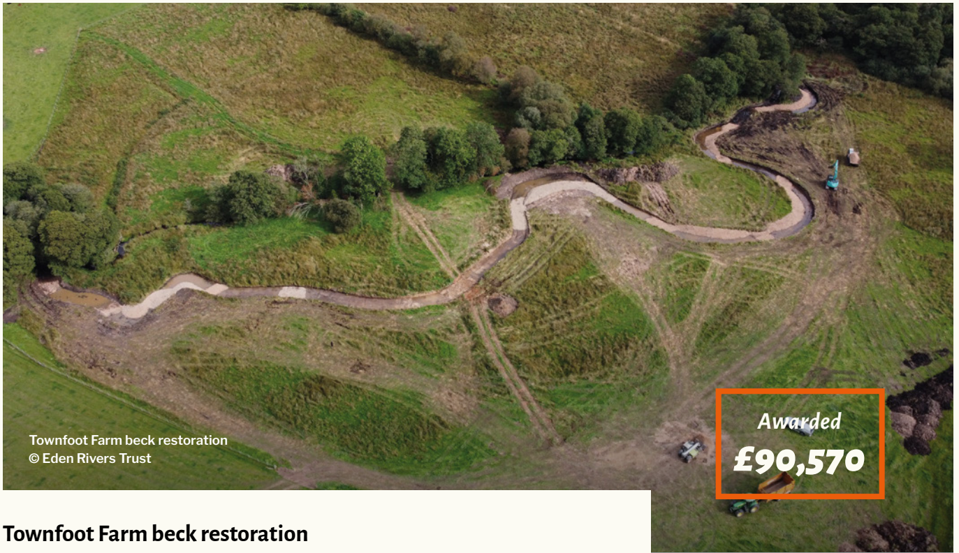
Townfoot Farm beck restoration