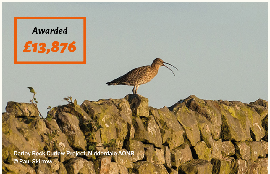
Darley Beck Curlew Project, Nidderdale AONB