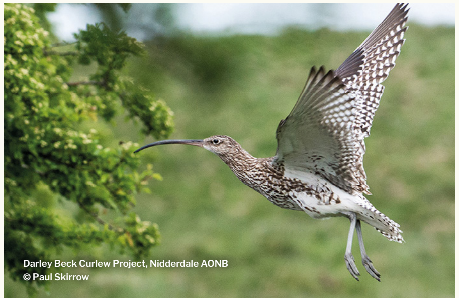
Darley Beck Curlew Project, Nidderdale AONB

PEOPLE Twenty volunteers have been trained to monitor curlew.