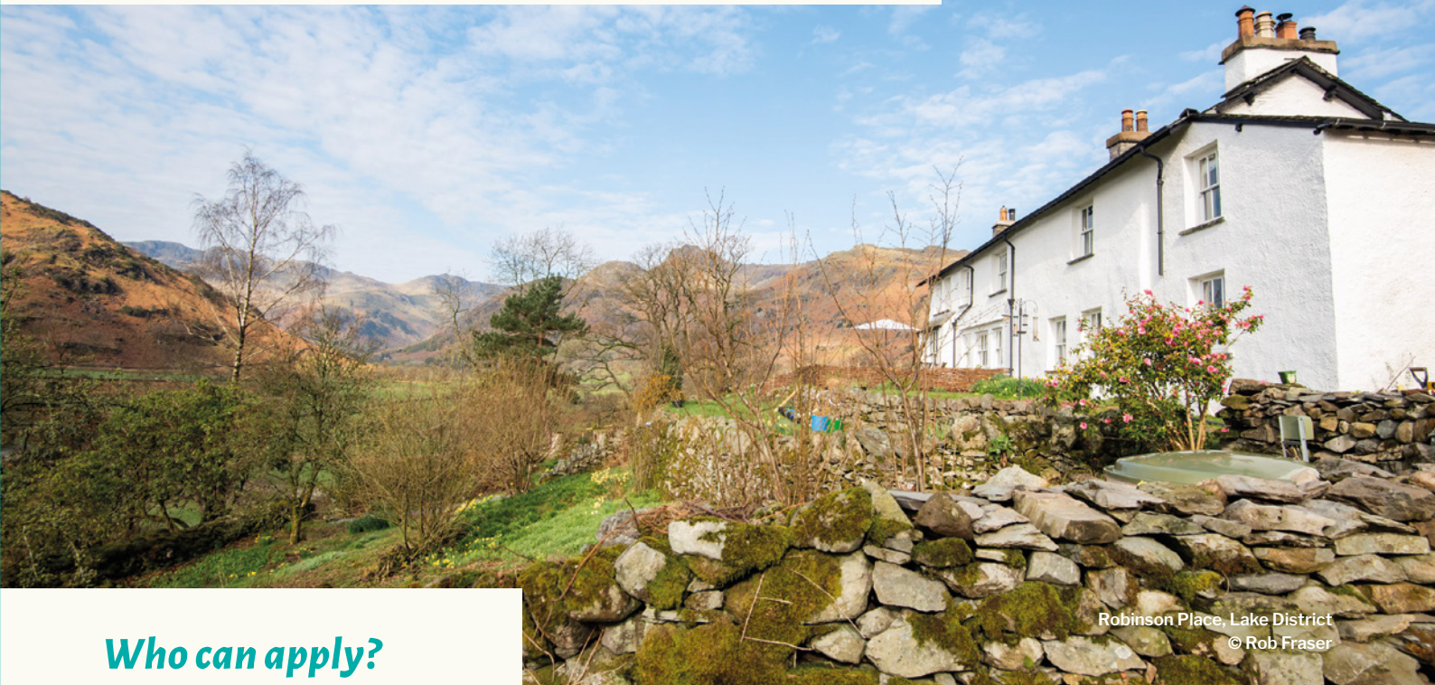
Robinson Place, Lake District

Local protected landscape teams worked closely with Defra to design the programme. This collaborative work continues so that improvements to the programme can be made on an ongoing basis.