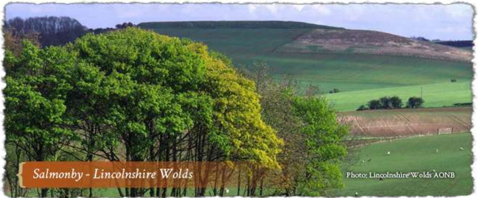
Salmonby - Lincolnshire Wolds

THE NATIONAL ASSOCIATION Areas of Outstanding Natural Beauty