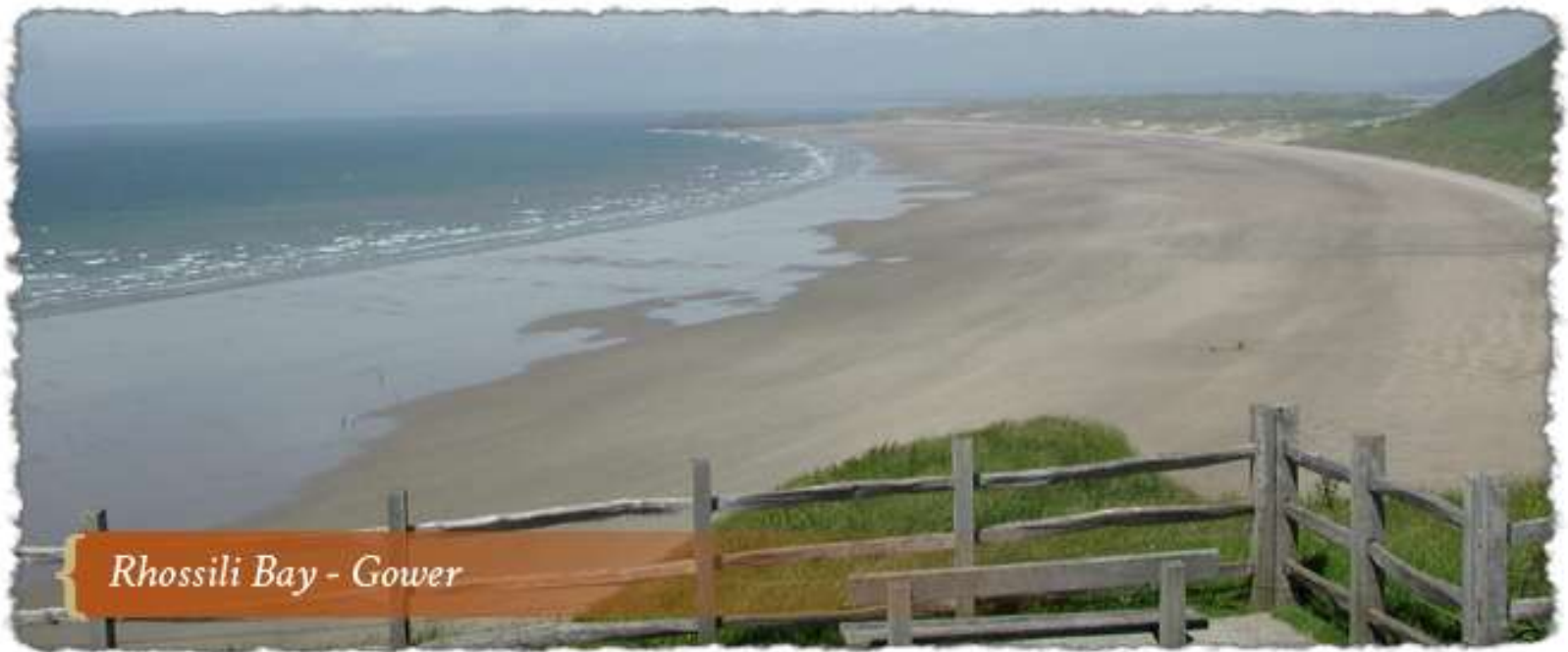
Rhossili Bay - Gower

THE NATIONAL ASSOCIATION Areas of Outstanding Natural Beauty