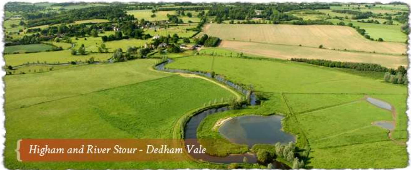
Higham and River Stour - Dedham Vale

THE NATIONAL ASSOCIATION Areas of Outstanding Natural Beauty