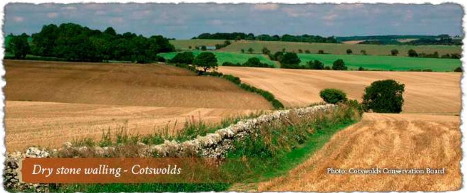
Dry stone walling - Cotswolds

THE NATIONAL ASSOCIATION Areas of Outstanding Natural Beauty