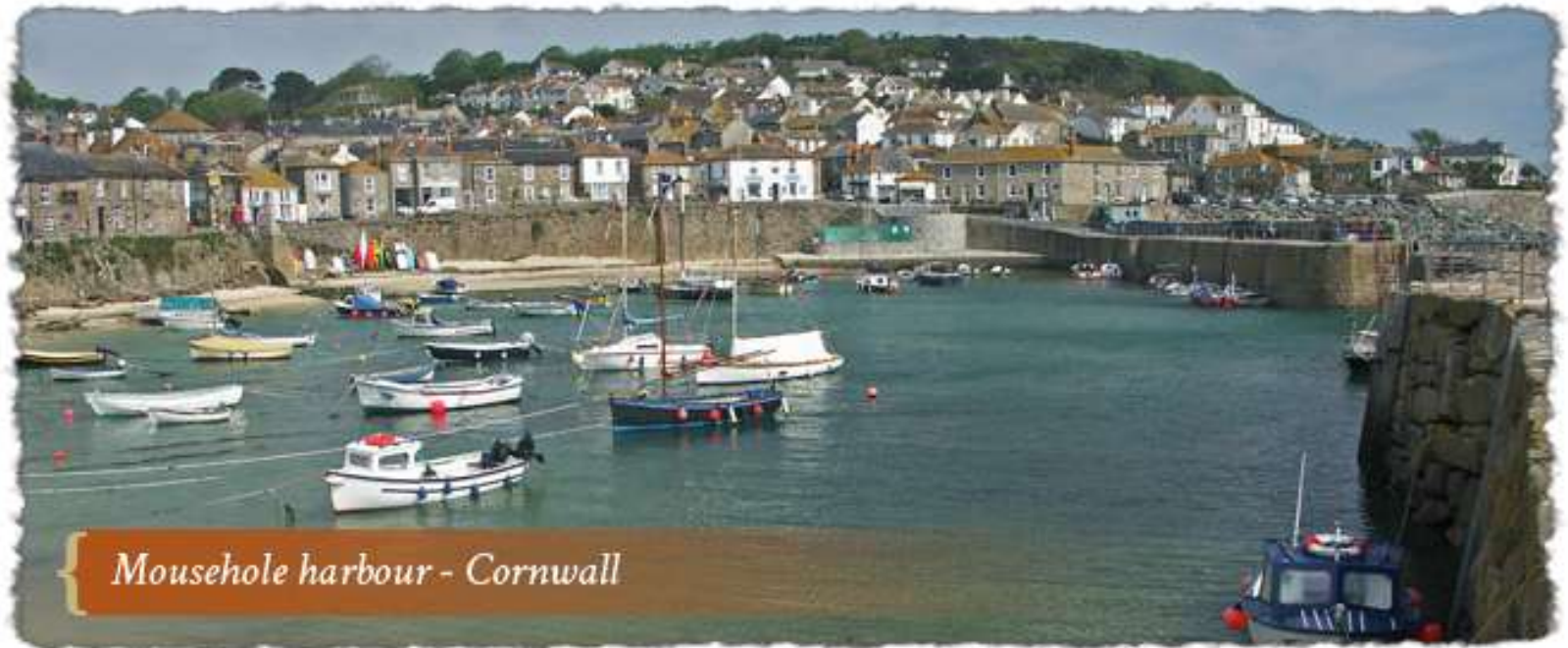
Mousehole harbour - Cornwall

THE NATIONAL ASSOCIATION Areas of Outstanding Natural Beauty