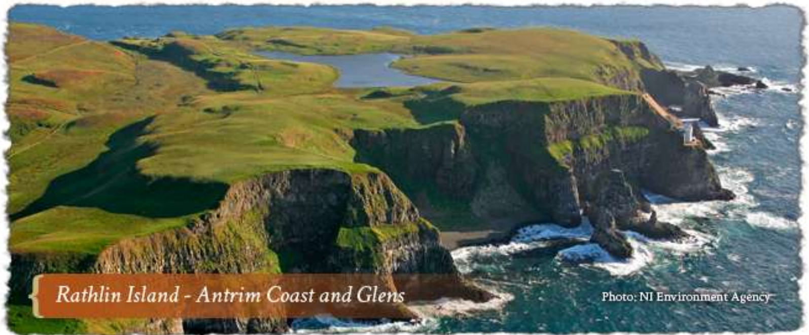
Rathlin Island - Antrim Coast and Glens

THE NATIONAL ASSOCIATION Areas of Outstanding Natural Beauty