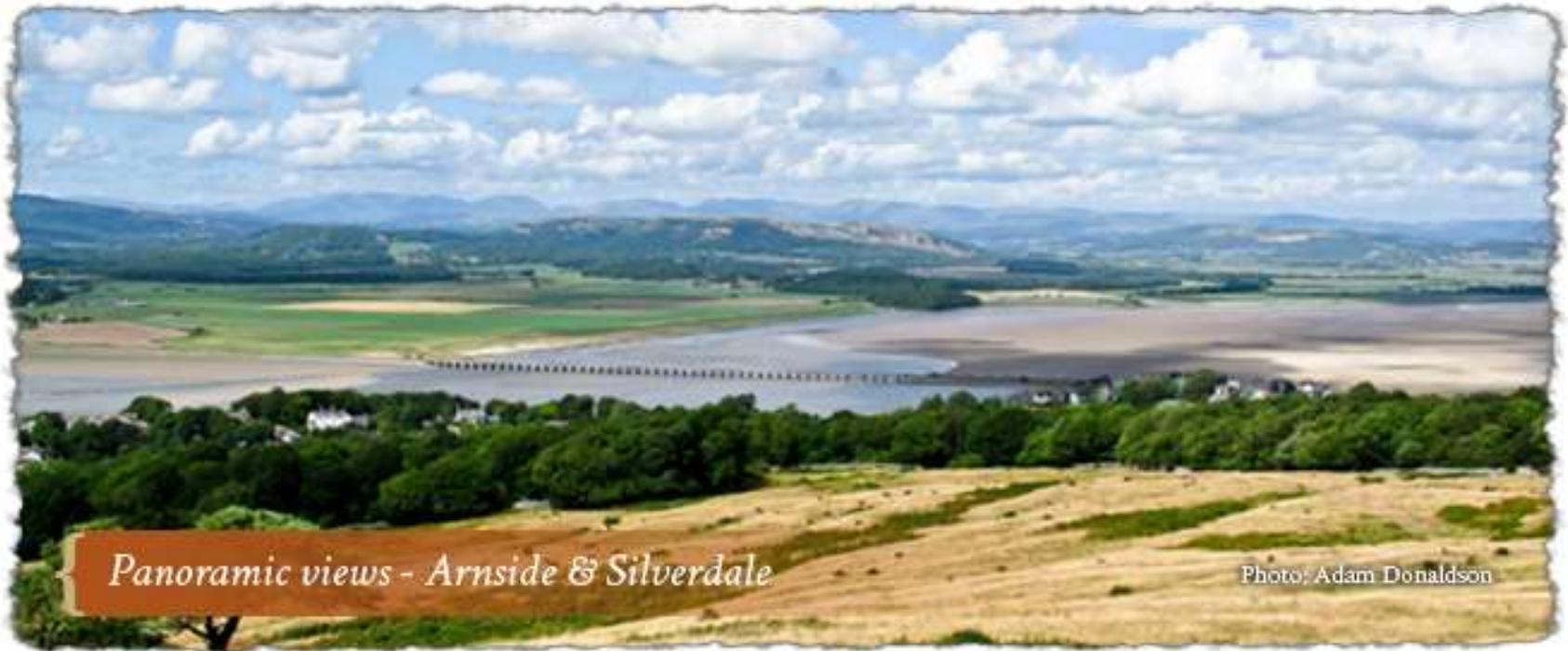
Panoramic views - Arnside & Silverdale

Of vital importance - let's keep it that way