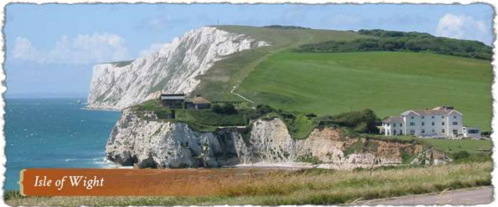
Isle of Wight

THE NATIONAL ASSOCIATION Areas of Outstanding Natural Beauty