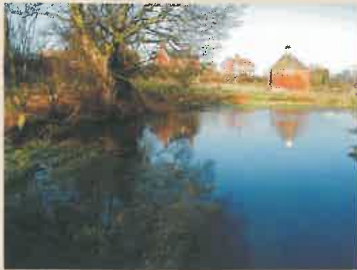
'Good water' springs and dovecote

Derived from the Norman word for 'good water', Belleau is a much smaller settlement now than it once was. The grassed over remains of the medieval village are to the far side of the 13th century church of St John the Baptist. The springs nearby - the 'good water' - are the beginnings of the Great Eau which flows from the Wolds, over the Middle Marsh all the way to the sea at Saltfleet Haven. There is an attractive dovecote in the village that dates back to Tudor times. This dovecote and a small barn nearby are all that remain of a much larger estate which included a medieval moated manor house.