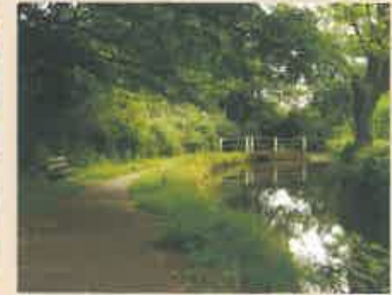
Footpath along the Long Eau

A line of freshwater springs run between Little Cawthorpe in the north and Claxby in the south. The water that flows from these springs fell on the Wolds some months ago and has travelled underground through cracks in the chalk. During this time, the water has been cleaned so that it is crystal-clear, improved with minerals and cooled to a steady temperature. If you look closely at the pond near the church you can see the natural spring water gently bubbling up at the surface.