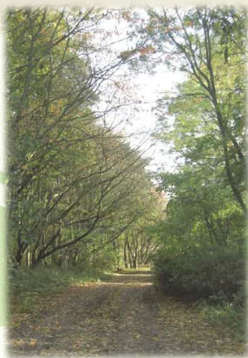
Well to Ulceby through woodland