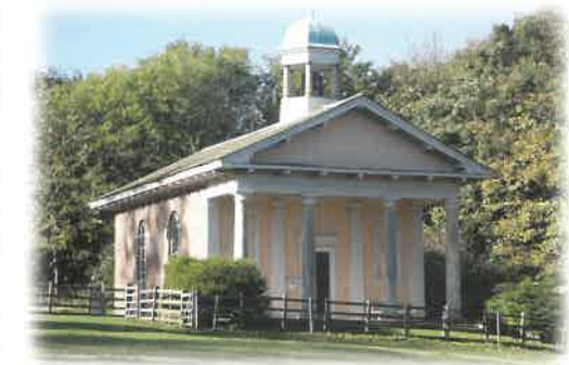
Well Church with a west facing altar

For bus services and Call Connect services to Alford contact Traveline on 0871 200 22 33 or www.traveline.info