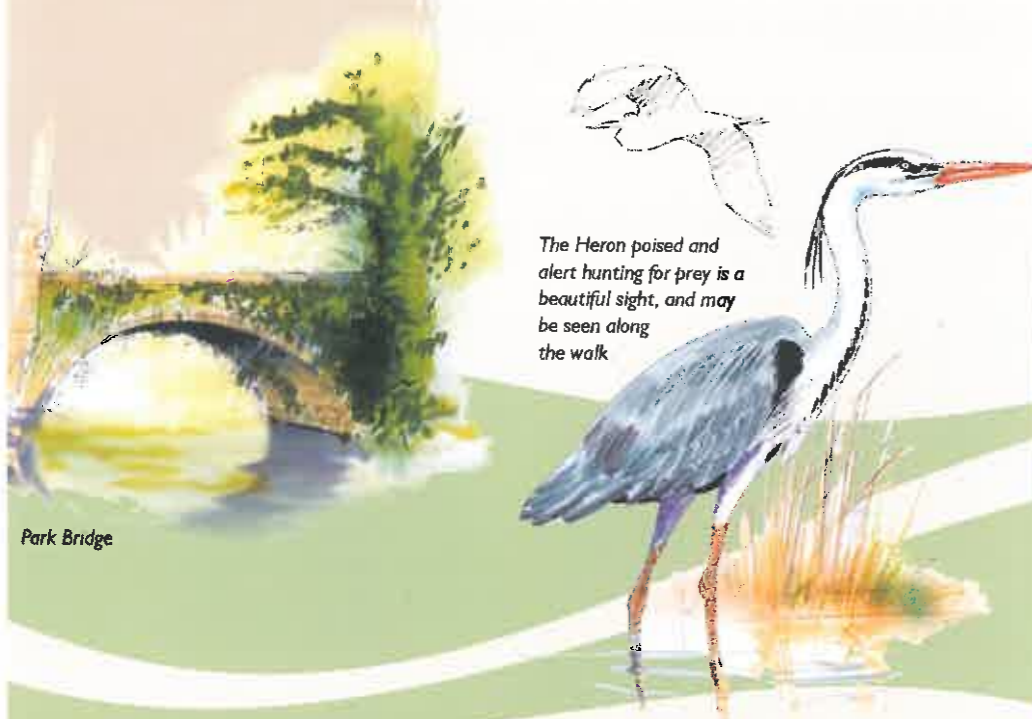
The Heron poised and alert hunting for prey is a beautiful sight, and may be seen along the walk

You can also strike out into the Swaby valley or visit the small church of St. Leonard at Haugh.