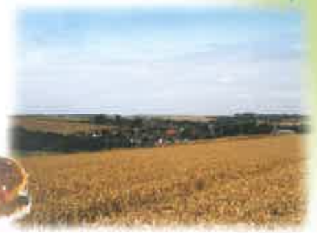
View towards Binbrook