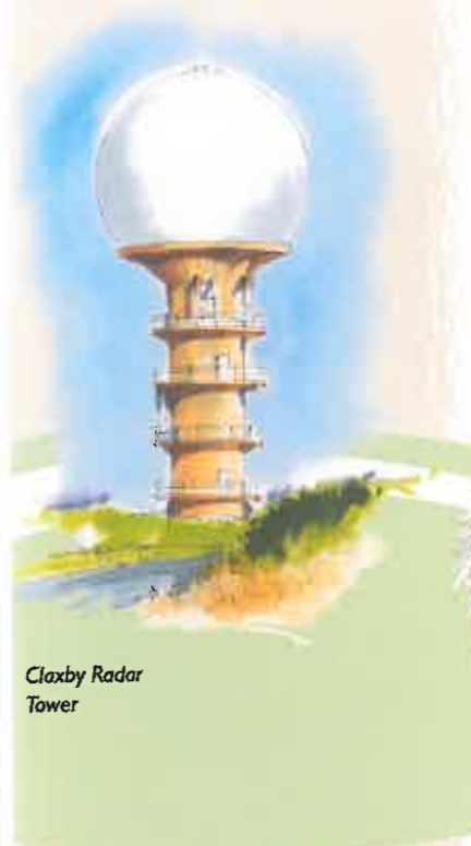
Claxby Radar Tower

Two walks that start from Market Rasen and head towards Middle Rasen, with routes mainly along roads, bridleways and quiet lanes. Lovely views of the Lincolnshire Wolds can be seen on these walks.