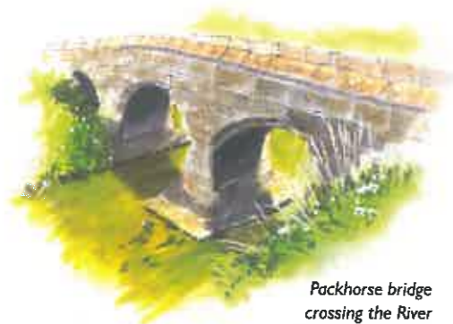
Packhorse bridge crossing the River Rase in West Rasen

The River Rase flows from the Lincolnshire Wolds down through Market Rasen and Middle Rasen and on to West Rasen, connecting all three settlements. The name Rasen comes from the old English word raesn, which means “a plank”. Perhaps this refers to a plank bridge or planks laid across the River Rase or marshy ground.