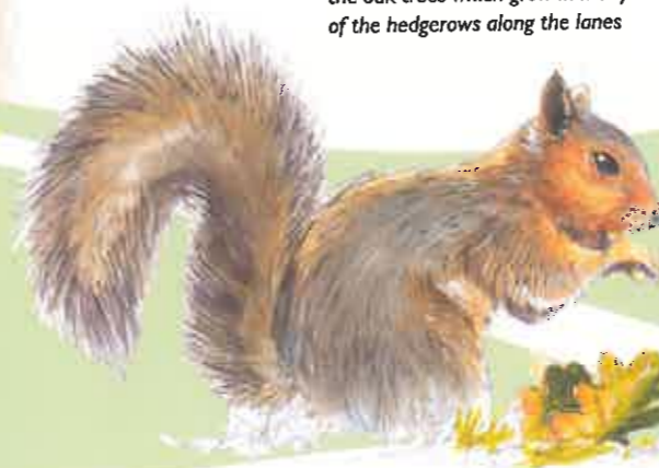
Grey squirrels are a regular sight in the oak trees which grow in many of the hedgerows along the lanes