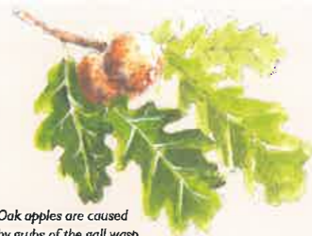
Oak apples are caused by grubs of the gall wasp

The church is well worth a visit, particularly as the south doorway is Norman and is one of the most impressive in Lincolnshire with three continuous bands of moulding.