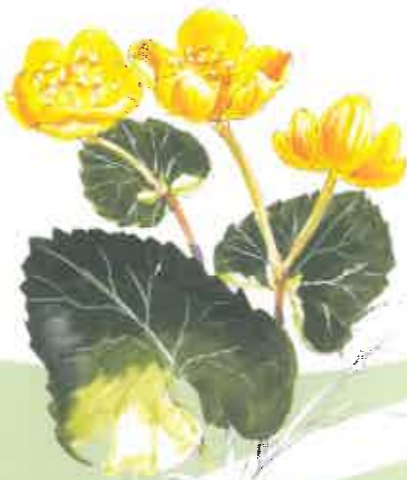
Look out for marsh-marigolds near the stream. They are sometimes known as kingcups

This is a varied walk mainly on grassy paths, and along a quiet country lane. There are some stiles and gates, as well as a few slopes. The paths may be muddy so stout shoes or boots are recommended.