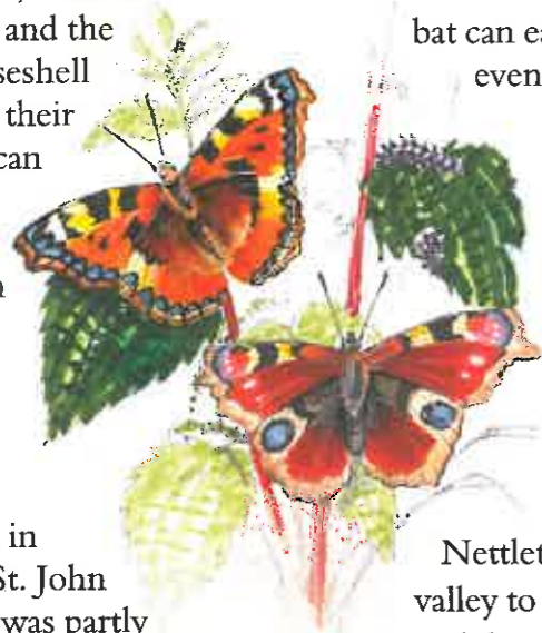
Small tortoiseshell & peacock butterflies

Nettleton was recorded in the Domesday Book, when it was known as 'Neteltone' that meant 'farmstead where nettles grow'. Many insects rely on nettles for their survival, such as the peacock and the small tortoiseshell butterflies - their caterpillars can be seen chewing the leaves in the spring and summer.