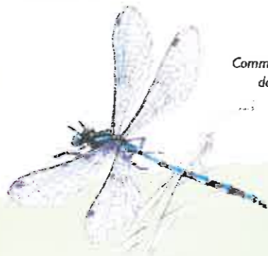
Common blue damselfly

Nettleton Beck runs through the valley to the village. Dragonflies and damselflies can be seen darting along the water. Some of the ponds are full of frogs and newts and sometimes you can see a heron on the bank patiently waiting for a fish to come within reach.