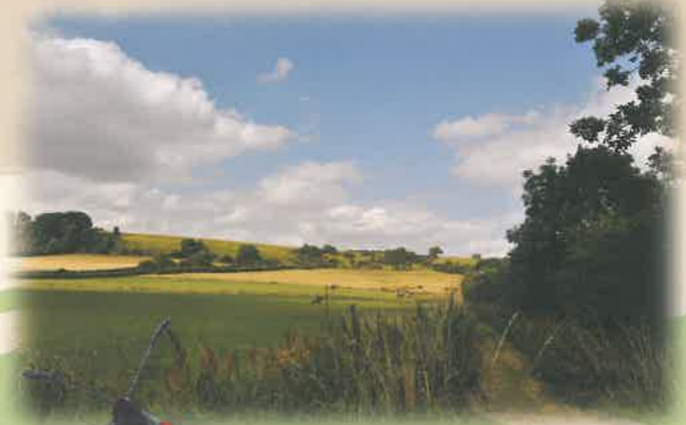
View toward Red Hill, Asterby

These pleasant walks circle the attractive parishes of Goulceby & Asterby and take you through gentle farmland, quiet lanes and along part of the Viking Way, offering stunning views over the Lincolnshire Wolds.