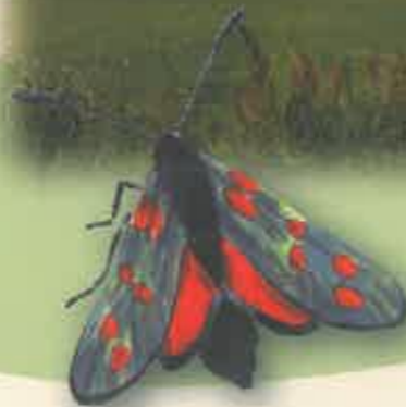
Six Spot Burnet Moth

Asterby, Goulceby and Ranby Parish Council is very grateful to the Parish Paths Working Party Volunteers and the Lincolnshire Wolds Countryside Service for the use of material and assistance in the preparation of this leaflet and to the Lincolnshire Wolds Sustainable Development Fund and Lincolnshire County Council, through its Parish Paths Partnership Scheme, for funding its production.