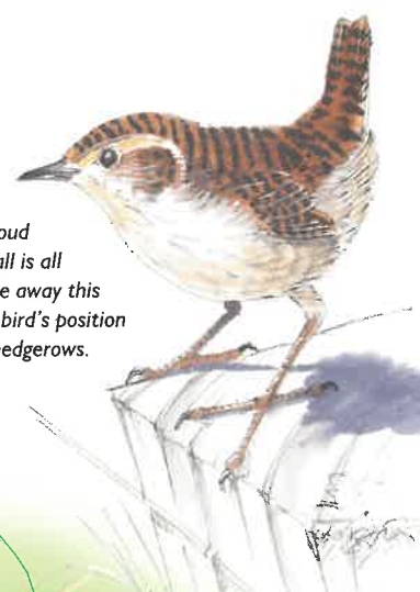
The wren's loud 'tit-tit-tit' call is all that may give away this tiny, darting bird's position among the hedgerows.

Lincolnshire County Council reproduced from OS mapping with the permission of The Controller of HMSO © Crown Copyright. Unauthorised reproduction infringes Crown Copyright and may lead to civil proceedings OS licence 100025370.