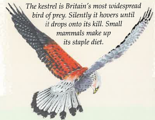
The kestrel is Britain's most widespread bird of prey. Silently it hovers until it drops onto its kill. Small mammals make up its staple diet.

These walks offer some of the best views in Lincolnshire across the Trent Valley towards Nottingham in the west, towards Lincoln in the south and the steelworks in Scunthorpe to the northwest.