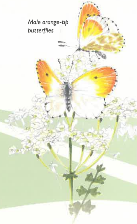
Male orange-tip butterflies