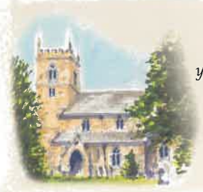
As you walk along the road, you may glimpse Claxby Church nestling in the foot of the Wolds