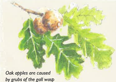
Oak apples are caused by grubs of the gall wasp

The church is well worth a visit, particularly as the south doorway is Norman and is one of the most impressive in Lincolnshire with three continuous bands of moulding.