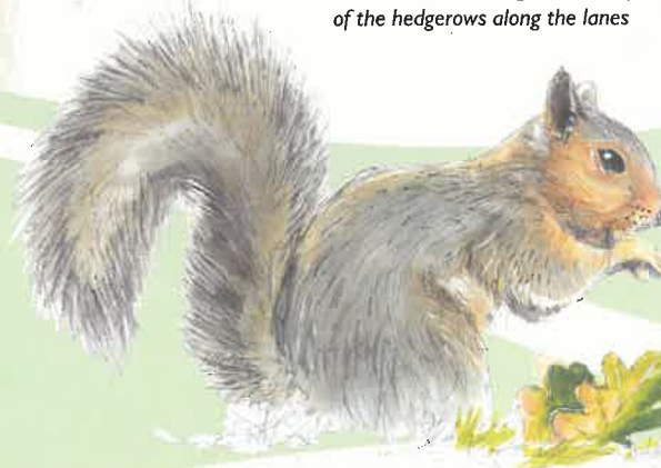
Grey squirrels are a regular sight in the oak trees which grow in many of the hedgerows along the lanes