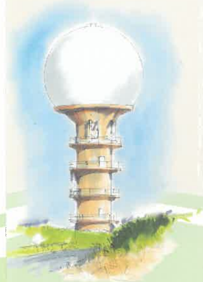
Claxby Radar Tower

Two walks that start from Market Rasen and head towards Middle Rasen, with routes mainly along roads, bridleways and quiet lanes. Lovely views of the Lincolnshire Wolds can be seen on these walks.