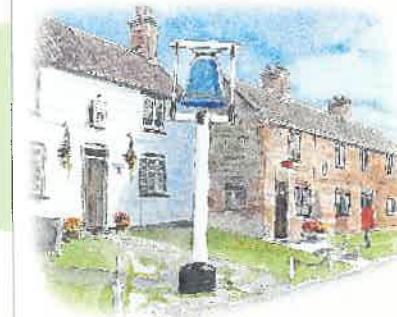
Blue Bell Inn

The South Wolds Hunt's Opening Meet (the first of the season) always starts at the Blue Bell Inn on the old village green. The building opposite the pub was once the village smithy.