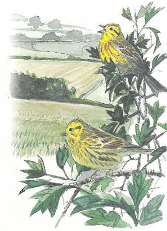
Yellowhammers - look out for their colourful plumage and listen for their song, 'little-bit-of-bread-and-no-cheese!'

Other birds that may be seen include lapwings, skylarks and yellowhammers: