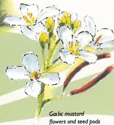
Garlic mustard flowers and seed pods

The walk is mainly on paths and tracks with some slopes, stiles and roadside walking.