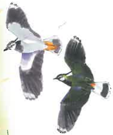
Lapwings, or peewits as they are often known locally, can be seen in large numbers in fields during the winter months.