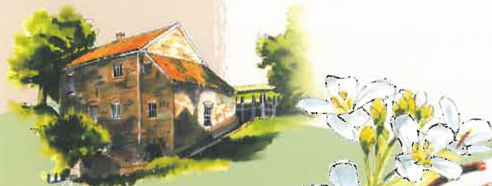
Binbrook Water Mill

Whilst both walks take in many interesting buildings and features, the longer walk also crosses an area rich with wild flowers.